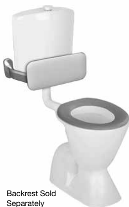
Backrest Sold Separately