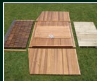
LAY OUT PRE-MADE PANELS