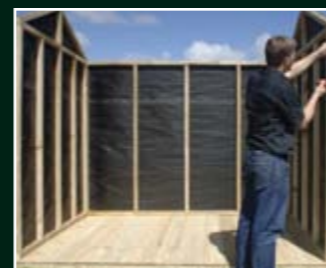
STAND UP WALL PANELS