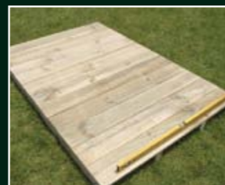
ASSEMBLE PRE-CUT FLOOR