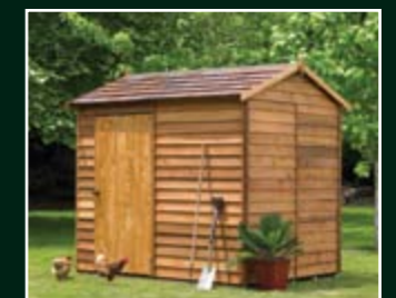
FILL IT UP