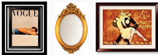
Picture frame, mirror etc...